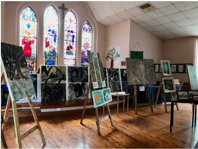
The Art at the Fair exhibition in 2023.

It will be hung in the chapel behind the church on Friday November 8 th .