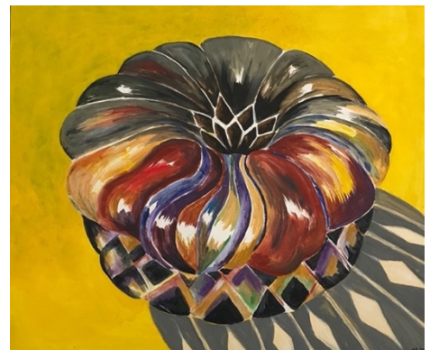
Heather Green. Acrylic