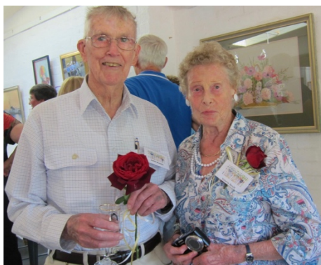
The opening of the "Archives" exhibition.