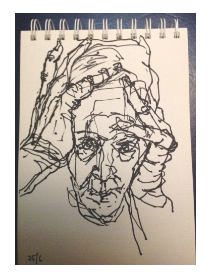
Portrait sketch by Olga Juskiw