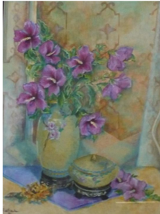
Some of Deb's colourful still paintings.

Editor's Note: Please contact me at jybalfour@outlook.com to tell me you will be a Spotlight On.... In a future edition. I would really appreciate some volunteers.