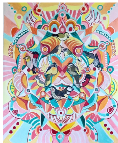
"The Wild Ones" Kylie Waldon"