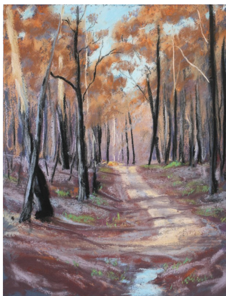
“And then there was Rain”

Invitation emails to enter exhibitions from various places have been received by AWAS and have been forwarded to members. They include Wangaratta, Broken Hill and Alice Springs.