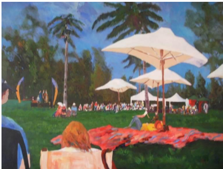
Music in Albury Botanical Gardens (Acrylic on canvas 75cm x 100cm)