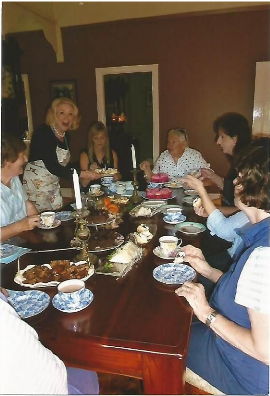
What a Spread!!