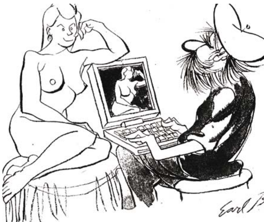
funny fix artist un-known