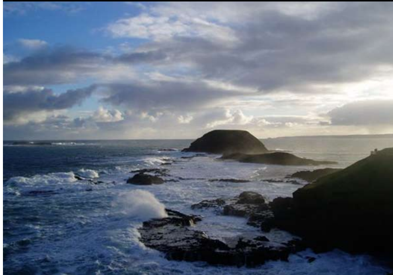
Top left: The group who enjoyed everything about Philip Island. Meg behind the camera! Top Right: There aren't just Penguins or Seagulls on Philip Island! Left: What a beautiful seascape. A moment definitely worth capturing. Copyright of course!!

BUS TRIP Friends of the Albury Art Gallery are organising a bus trip to see the Art Deco exhibition currently showing at the National Gallery of Victoria. Saturday September 13th Bus departs Albury Railway station 7.30 am, returns to Albury approx 7pm. Cost: $45 (Less for ARAG members). Entry to exhibition additional ($22, Conc. $18) Book at the Art Gallery 0260513480, email artgallery@alburycity.nsw.gov.au Pay by 4pm Monday September 1st.