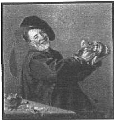
Judith Leyster Jolly Toper