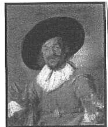
Frans Hals The Merry Drinker