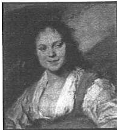
Frans Hals The Gypsy Girl