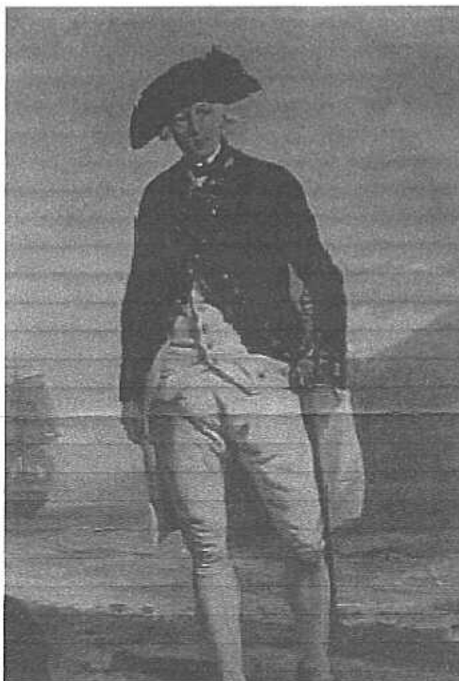
Admiral Arthur Phillip (1786 portrait by Francis Wheatley, National Portrait Gallery, London)